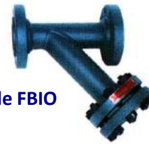
Style FBIO Type 57-SO "Y" Strainer with Slip-on Flanges Type 57-WN "Y" Strainer with Weld Neck Flanges