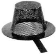
Type 51-P Basket