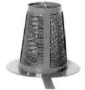
Type 51-S Basket With Straps