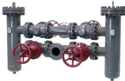
Type DU56-F In-Line Duplex