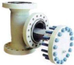
Type 59-F Inline "T" Strainer

150# to 2500# RF and RTJ Carbon Steel, 304SS, 316SS, & Alloys