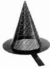
Type 50-P Cone