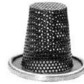
Type 51-RTJ Ring Joint Basket

P – Perforated WIP – Wire Cloth Inside Perforated WOP – Wire Cloth Outside Perforated