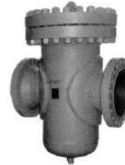
Type 55-F Simplex Strainer with Flanged Cover