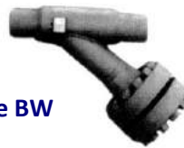
Style BW Type 57-BW "Y" Strainer

FBIO - Flanged Both Inlet and Outlet BWIO - Butt Weld Inlet and Outlet FIBO - Flanged inlet, Butt Weld Outlet FOBI - Flanged Outlet, Butt Weld Inlet