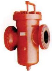
Type 55-Q Simplex Strainer with Quick-Opening Closure