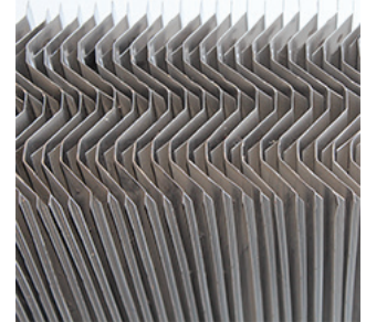
Typical Vane section

NOTE: Connections shown are typical and will vary with customer requirements.